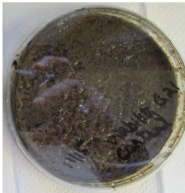
Fig2: Spores Viability control - heavy fungal growth © Accugen labs

Test sample did not support any fungal growth. © Accugen labs