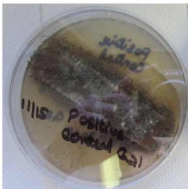
Fig3: Positive control - heavy fungal growth